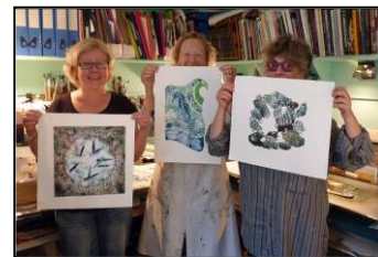
Plate Making Wed 17 th Feb Sat. 20 th Feb Printing Thurs. 18 th Feb Sun. 21 st Feb

No art or printing experience required - all materials provided - see website for booking form etc.